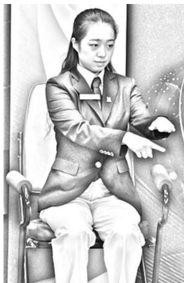
Figure 4 Below the playing surface